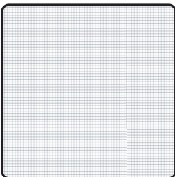
Silver Alginate Dressing